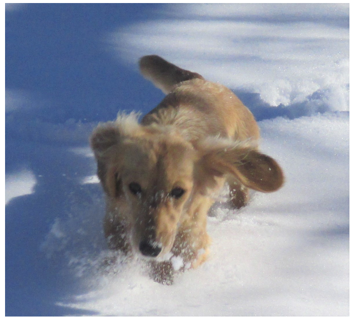
Isabella dashing through the snow in South Carolina.

Transmission of the dog flu is easier than you think. All it takes is a mere touch of a contaminated bowl or a pet from an exposed human hand.