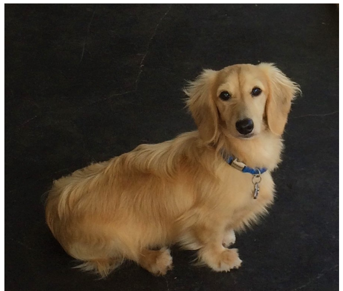
Our sweet, beautiful Chanticleer is growing up. He reminds us every day how special a little doxie can be.

Anyone that has a dachshund knows they love to dig when given the opportunity, some more than others, but the instinct still remains firm even after years of being loveable couch potatoes. Dachshunds were bred to have oversized front feet; broad, compact, with strong nails and thick pads. Although the back feet are smaller than the front they still have rugged back pads. There was a time in dachshund history when the doxie was considered a working member of the hunting party and not a family companion. For centuries their job was to tunnel down into burrows with their long, slender body, using their huge paddle like feet to capture their prey. Mother Nature designed these unique paddle paws to be powerful tools for the dachshund to perform their designated role as hunters. They are indeed Mother Nature's best naturally made shovels.