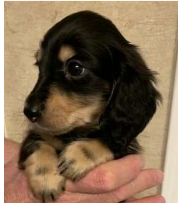
Reagan is enjoying life with his new and loving family in Pennsylvania.

One of the first movies to win the Best Picture Academy Award , was the Grand Hotel in 1932. It is recognized as the first movie to have multiple headlining stars together in a film: Greta Garbo, Joan Crawford, John Barrymore, Lionel Barrymore and Wallace Beery. It isn't a perfect, or even a great movie, but it is an interesting study in "ancient" movies. The lighting is of poor quality, the acting was tiring, both making it hard to understand what is really going on much of the time. But, if you look really, really hard you will spot a black dachshund in four short scenes. In the movie, John Barrymore plays the part of a Baron who loves coddling his dachshund. The dachshund comes to a tragic end as he and the Baron are swept away erasing the memory of the Baron and his dog ever having been at the Grand Hotel . While filming, John Barrymore was known to have commented he would much rather spend time with the dog, even over the mega stars whom he shares the stage.